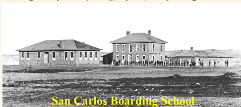
San Carlos Boarding School

So they put all the girls in that room. My mother was in there with them. They were supposed to stay in there. But somebody went and put something sticky—like jeeh [pinyon pitch] or a gum—in